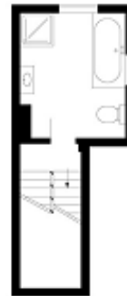
First Floor Half Landing